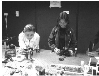
Fig. 2 Project Students working in the holography laboratory.